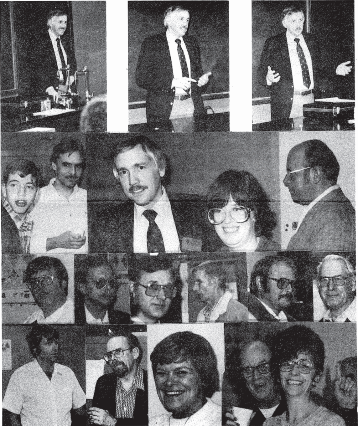
Layout K19G