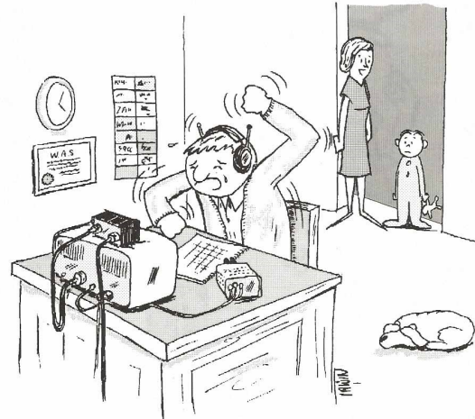
'It's best not to disturb Daddy when he's chasing rare DX!'