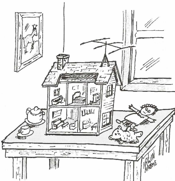
The origin of QRP.