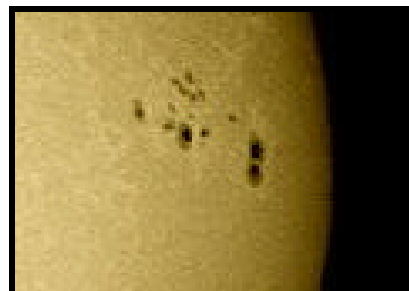
Sunspot AR375 that caused the poor band conditions during Field Day.

A much safer way to see it is to visit space-weather.com . Go there to find safe solar observing tips and to recent images of this emerging active area of our Sun. ARNewsline