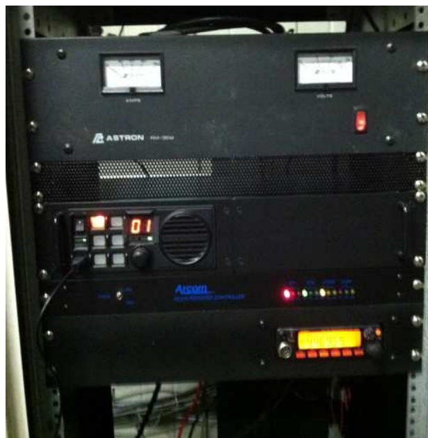
- Power Supply

In the right photo, the bottom cylinders are cavity filters, which separate the incoming frequency and the outgoing frequency, and directs them to the proper receive and transmit ports on the repeater. These are very sharp filters and are tuned to our specific frequencies.