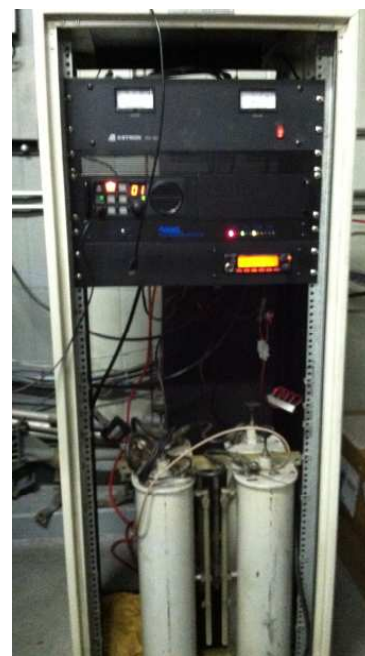
Cavity Filters -

Programming to the repeater and controller is done by using a computer and associated software for each.