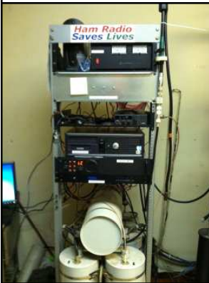
To the left is the 146.610 repeater.