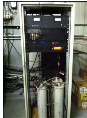
To the right is the 147.000 repeater.