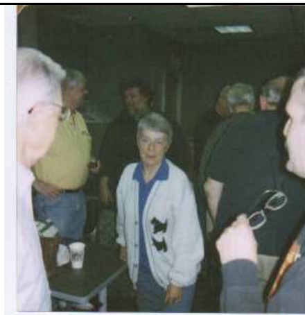
Break time at April 8, 2005 meeting.