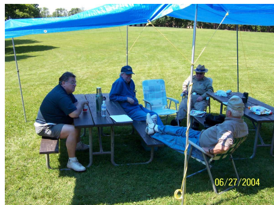
Field Day activities for 2004, some times you operate and other times you catch up on the local happenings.